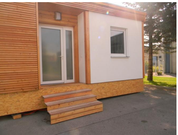
An example of a properly insulted wall