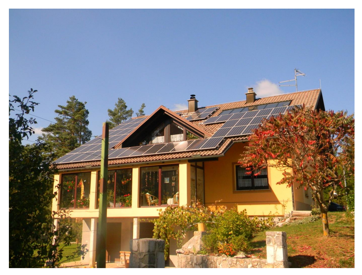
The house at Begunje with 54 PV's and the conservatory with overhanging roof

Solar panels were much commoner in Slovenia than in Scotland and assisted with water heating and boosting the heating systems. Photo voltaic was also installed in one of the houses that we visited although the owner was waiting to get connected to the grid. He has an impressive number of PV's on his roof top and had also designed his house to make use of passive heating. A 2<sup>nd</sup> floor conservatory was cleverly designed to be in shade in the summer and full sun in the winter. This house had an old style ceramic stove in their living room where they dried fruits for winter consumption. Their water boiler was connected to the solar panels and despite using oil for fuel their consumption had dropped from 2,000 litres of oil to 600litres per year. They had decided that their next investment was going to be a logwood boiler.