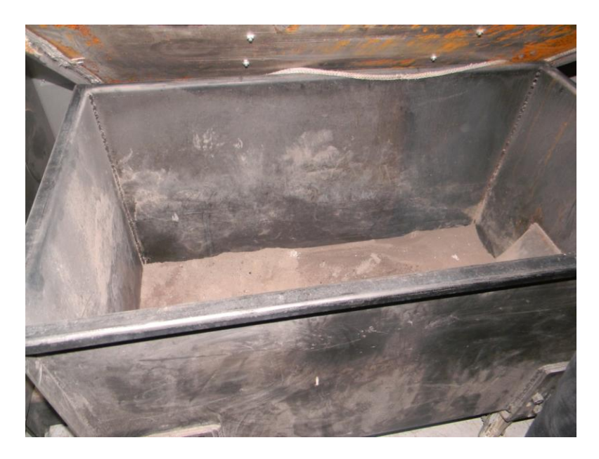
Ash from the 200kW boiler after a week of burning

However I was interested to hear about the fact that they utilised every last bit of the wood source and that ash production was minimal with a shallow amount of ash produced for a 200kW boiler every week. This also means that there is such a little amount of smoke produced that there is not a fine particulate problem in the atmosphere. In Scotland planning authorities are keen to promote biomass as a means of reducing fossil fuel used and to help to reach ambitious Scottish government targets for the Climate Change (Scotland) Act 2009. Particulates are often a reason cited by communities keen not to use biomass. However the examples I saw in Slovenia have helped to alleviate any concerns I had and I will promote theses examples of good practice. Biomass in Scotland is also a bit more problematic as often it is waste materials that are promoted as the "fuel" source which create a different variety of concerns.