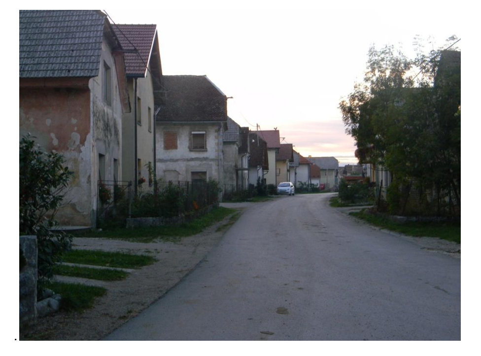
A typical street in Dolenje Jezero

Lake Cerknica lies in a depression of the limestone plateau known as karst which, due to the subterranean caverns results in it being completely drained in autumn due to the low rainfall. We walked around the edge and it was hard to believe that it was the largest lake in Slovenia as it was bone dry. It is protected by European legislation and is one of several Natural sites in Slovenia.due to the many species of birds. When we were there in October there should have been water starting to appear in the lake. However it has been the driest summer in a long time and we were able to see the limestone cavern entrances and shallow depth.