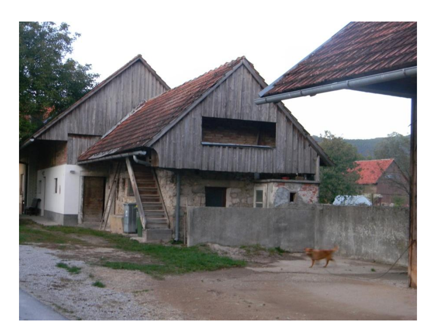
Combination of old and new at Dolenje Jezero